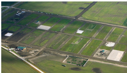
The most recent aerial photo of Central Iowa Expo site. White areas on the grounds are graveled lots. An administration building is being built on the diagonal road lower left.

Despite continuous rains that have devastated large portions of Iowa, construction on the Central Iowa Expo site is going strong, says Andy Long , VenuWorks' Acting General Manager for the new facility. The Expo site will be the biennial host of the Farm Progress Show, the nation's largest outdoor farm show that draws more than 500 exhibitors and 240,000 attendees.