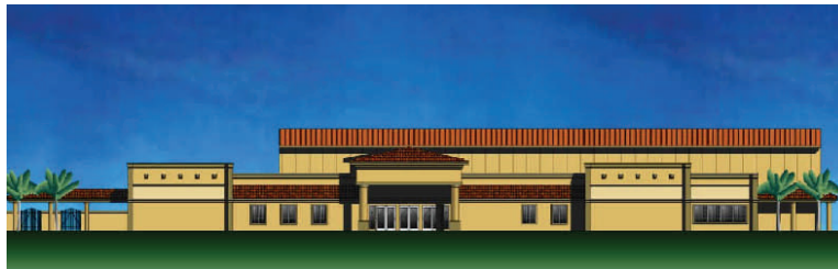
Aransas Pass Civic Center