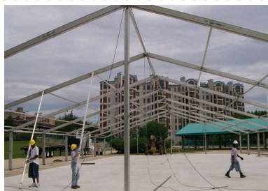
Workers install Racine Civic Center's new clear span building

In a major upgrade to its outdoor festival grounds, the Racine Civic Centre is replacing a portable tent with a new clear span structure. Larger than the tent, the new structure will have a permanent aluminum frame anchored into the concrete with trusses that can each hold 1,000 lbs. of lights and sound equipment. The new structure, which cost $86,000, is guaranteed to withstand up to 80 mph winds. The frame and fabric each have 7-year guarantees. Another eight years of fabric life will be achieved by removing it each winter. Most important to Executive Director Jim Walczak , it will go up earlier in the spring and expand offerings to clients and patrons. More facility upgrades include tuck-pointing, landscaping, new air conditioning, lighting control, icemakers and walk-in coolers, and hopefully, new seating for the Auditorium.