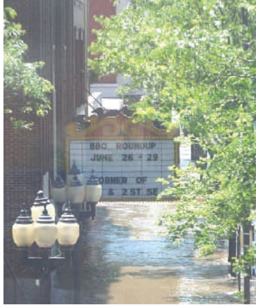
Water reached the underside of the marquee at the Paramount Theatre during the worst of the June flooding that ravaged downtown Cedar Rapids, Iowa.

When the Cedar finally crested at a record 31.2 feet, nearly 20 feet above flood stage, the flood had inundated more than 1,300 city blocks, displacing an estimated 24,000 residents. The entire downtown area was engulfed in water. On one downtown street the current was moving so fast that every parking meter was bent over in the same direction and at the same