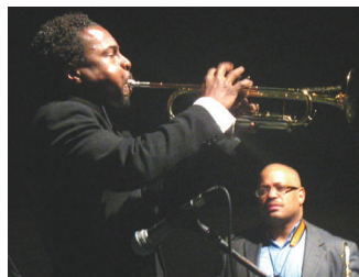
Roy Hargrove performs at the Alcorn State University Jazz Festival in April at the Vicksburg Convention Center