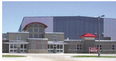
Clay County Regional Events Center

The Clay County Regional Events Center, located on the Clay County Fair Grounds in Spencer, Iowa proved to be very "eventful" during this fall's Clay County Fair. In addition to the 80+ exhibitors housed in the arena for nine days, the ball-