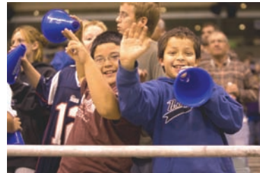
Some of the 700 Northwood fans cheer on their team from the stands at "Kick Back to Northwood" event at the Alerus Center.

In August, a tornado devastated the town of Northwood, North Dakota. Many homes and businesses were destroyed. The outpouring of volunteer help, support and donations to this town was overwhelming and the Alerus Center wanted to play a part in