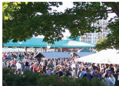
Crowds pack the grounds for the September Great Lakes Brew Fest.