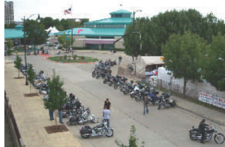
Members of the Harley Owners Group begin to assemble in front of Festival Hall in Racine in August.