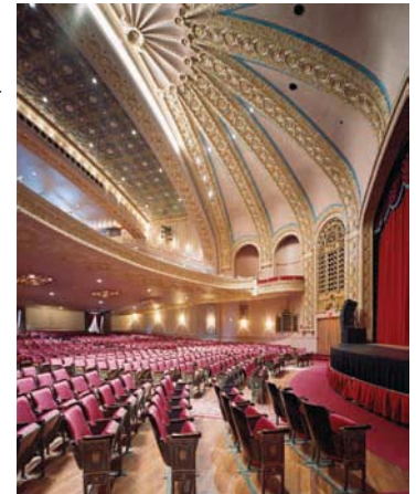
Hoyt Sherman Place