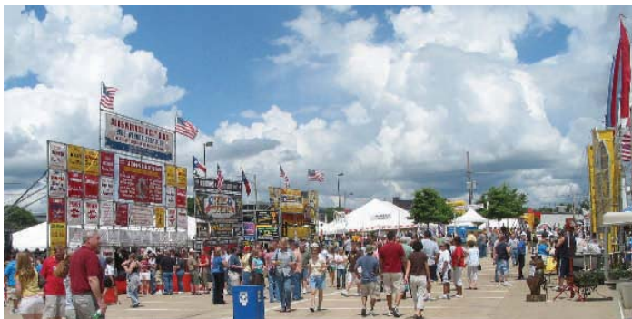
After 18 years across the street from the U.S. Cellular Center, The Cedar Rapids BBQ Roundup was a huge success this year in a new roomier location, featuring more sponsors, a classic car show, game zone, live entertainment, and over 20,000 people through the gates for the 4-day event.

The Adler Theatre, built in 1931 and completely restored in 1986, hosts a Broadway series, a variety of performing arts, and is home to the Quad City Symphony. It is adjacent to the architecturally stunning RiverCenter, that includes two open atriums, 11 meeting rooms, two exhibit halls, (one with 32,400 sq. ft. and the other with 13,200 sq. ft). They are linked by skyways to the Radisson Quad City Plaza Hotel, the primary caterers for the RCAT.