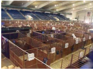
The Swiftel Center Arena set for the Region 6 Arabian Horse Show.

Swiftel Center is housed on 30 acres of land with over 70,000 square feet of convention and exhibitor space. The Swiftel Center offers space to accommodate conventions, trade shows, wedding receptions, banquets, meetings, livestock sales, and spectator events such as sporting events, concerts, rodeos, circuses, sportsman shows, motor sports and more.