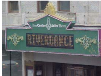
Adler Theatre marquee